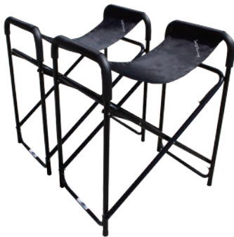
Steel trestles (small for 1s & 2s)