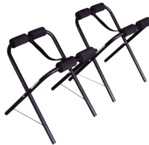
Steel trestles (simple for 1s & 2s)