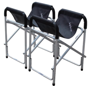
Aluminium trestles (small for 1s & 2s)