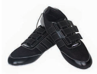
Swift Racing shoes Sizes 37-54 available