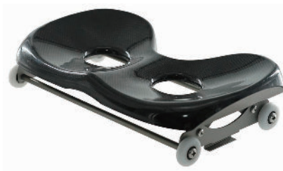
A. Single action type with bearings, height adjustable. (Sea2)

Club A boats are supplied with lightweight carbon seat tops.