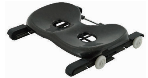
B. Double action type (add extra 220g per seat) (SeaD1)