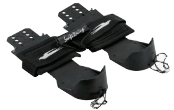
Flexfoot Heel restraints and solid heels for safety, rounded heels for a good fit. Approved by USRowing and British Rowing.