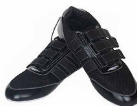
Swift Racing shoes Sizes 37-54 available