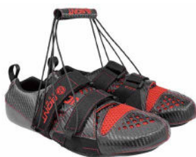
Bont Rowing shoes Sizes 36-53 available, but they are smaller than normal, so order 1 or 2 sizes larger.