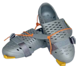
Active Tools adjustable shoes 2 sizes available: 40-45 and 43-48