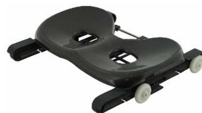
B. Double action type (add extra 220g per seat) (SeaD1)