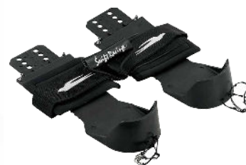
Flexfoot Heel restraints and solid heels for safety, rounded heels for a good fit. Approved by USRowing and British Rowing.