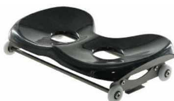
A. Single action type with bearings, height adjustable. (Sea2)

Elite and Club A boats are supplied with lightweight carbon seat tops.